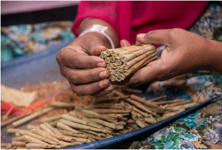
Tendu leaves can be rolled into thin cigarettes.